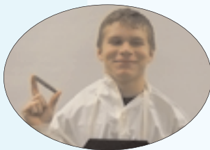
He has a mass of hair, wears thick glasses, and his side pockets are bulging... this must be... Professor Kokintz