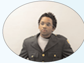
A watchful U.S. Army officer who somehow radiates suspicion... His name is... General Snippet